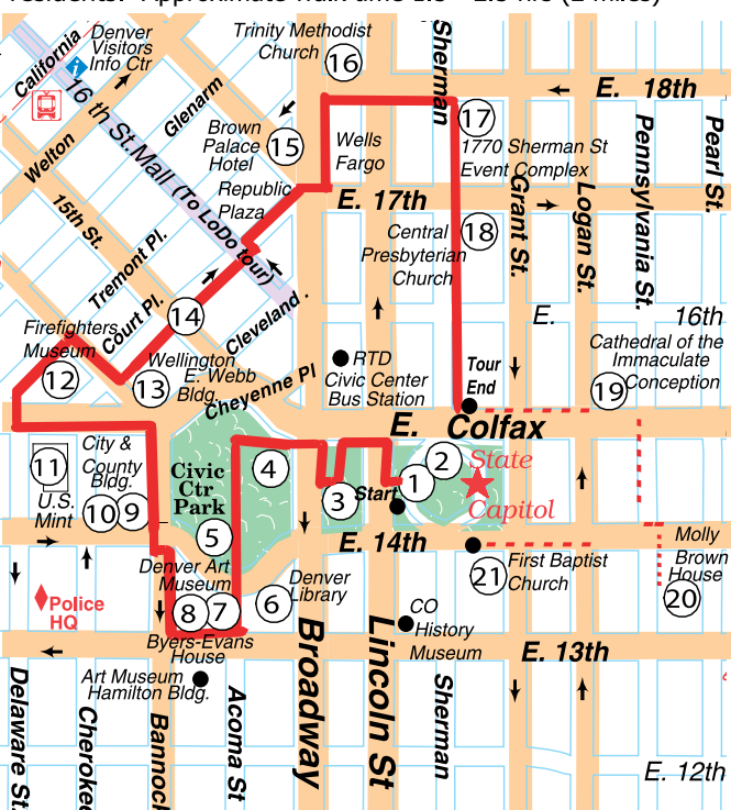
Stops 19-21 are bonus stops for those who wish to extend the tour Extended route is indicated with red dashed line - - -